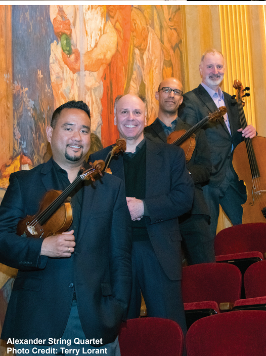
Alexander String Quartet