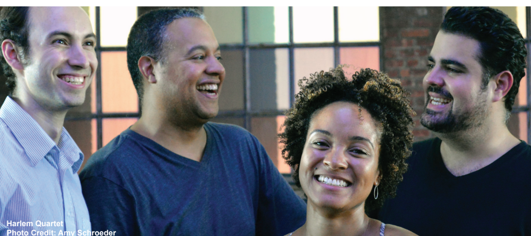
Harlem Quartet