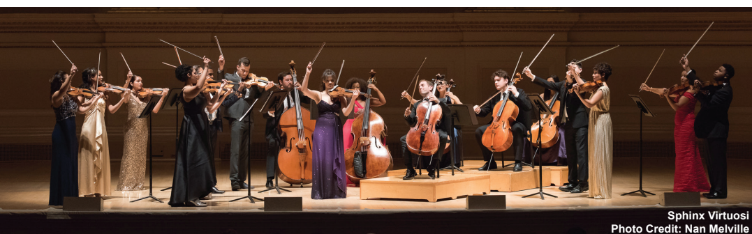
Sphinx Virtuosi

Co-sponsored by The Dean's Office of UB's College of Arts and Sciences