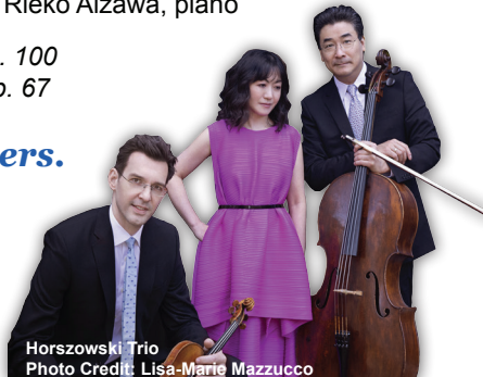
Horszowski Trio

"The Horszowskis are power players. ...Memorably monumental." - Los Angeles Times