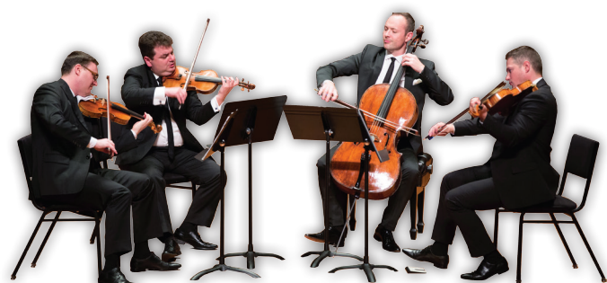
Jerusalem Quartet