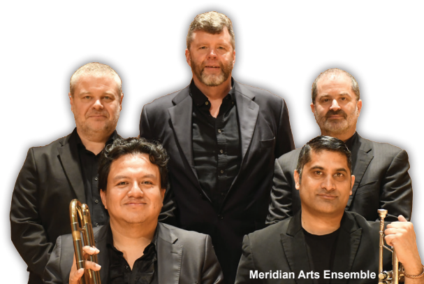
Meridian Arts Ensemble