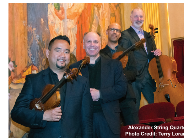
Alexander String Quartet

"Vibrant, probing, assured." - New York Times