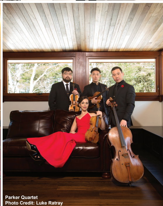
Parker Quartet